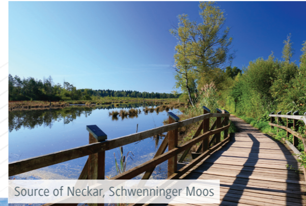
Source of Neckar, Schwenninger Moos