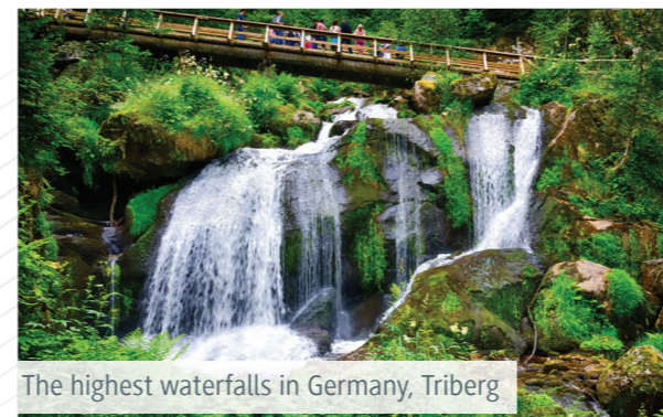
The highest waterfalls in Germany, Triberg