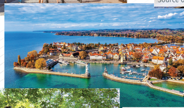
Lake of Constance