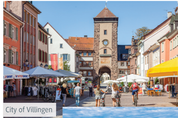
City of Villingen