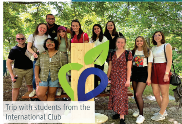
Trip with students from the International Club