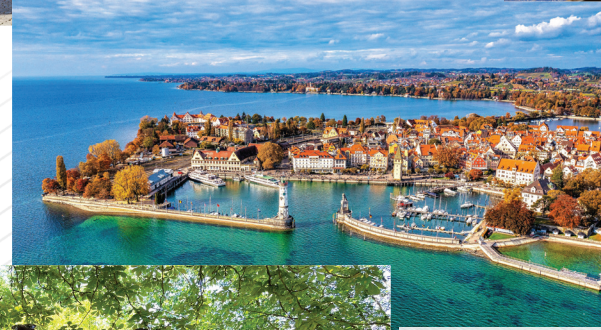
Lake of Constance