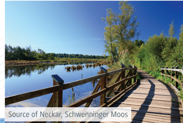
Source of Neckar, Schwenninger Moos